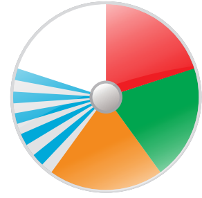
SL-1 Colour Wheel